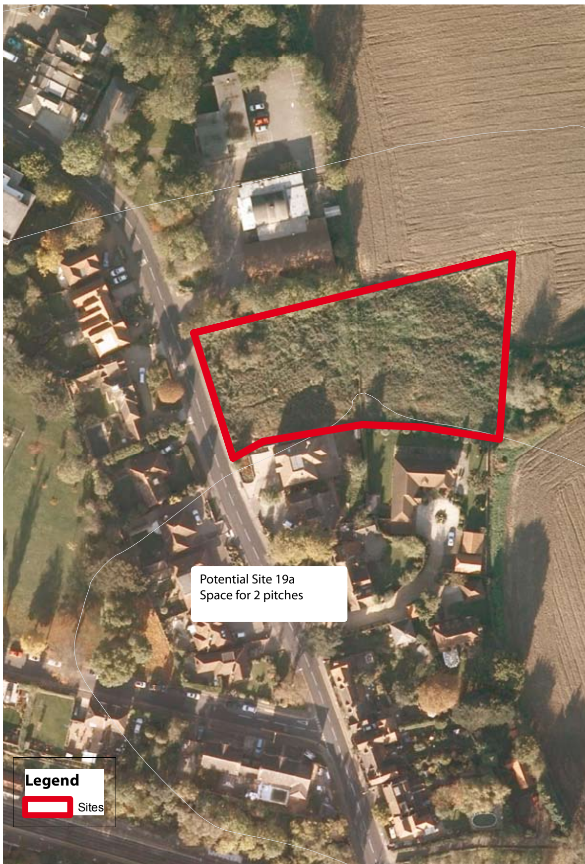
Figure 30 Possible Site South of Victory Hall, Hainault Road Chigwell