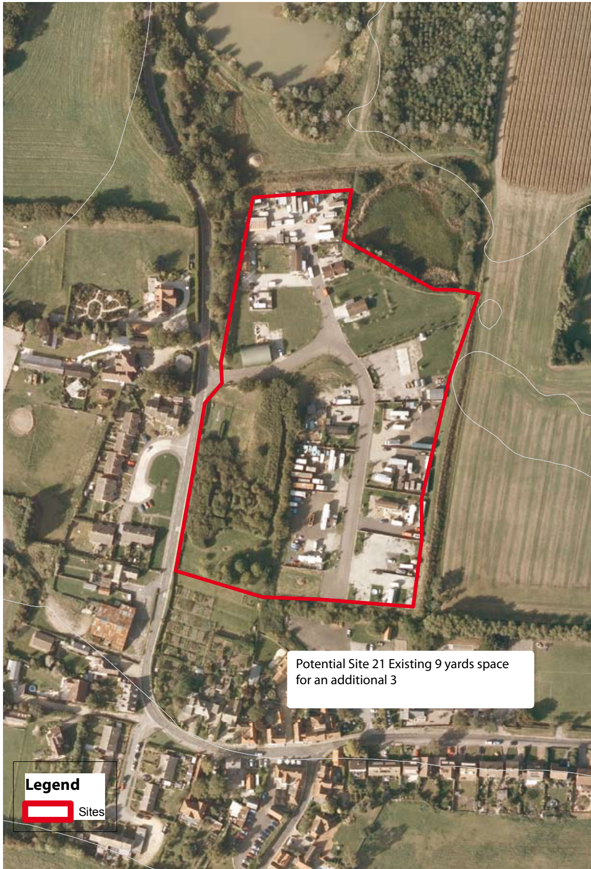
Figure 33 Travelling Showpeoples Site - Moreton