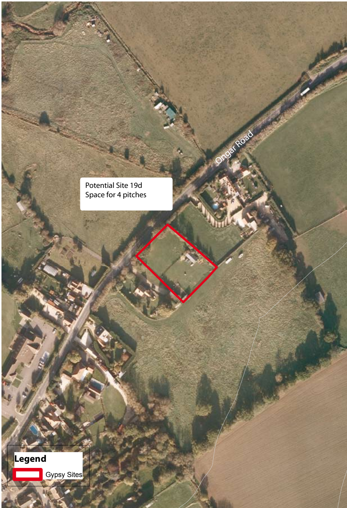
Figure 32 Possible Site East of Abridge