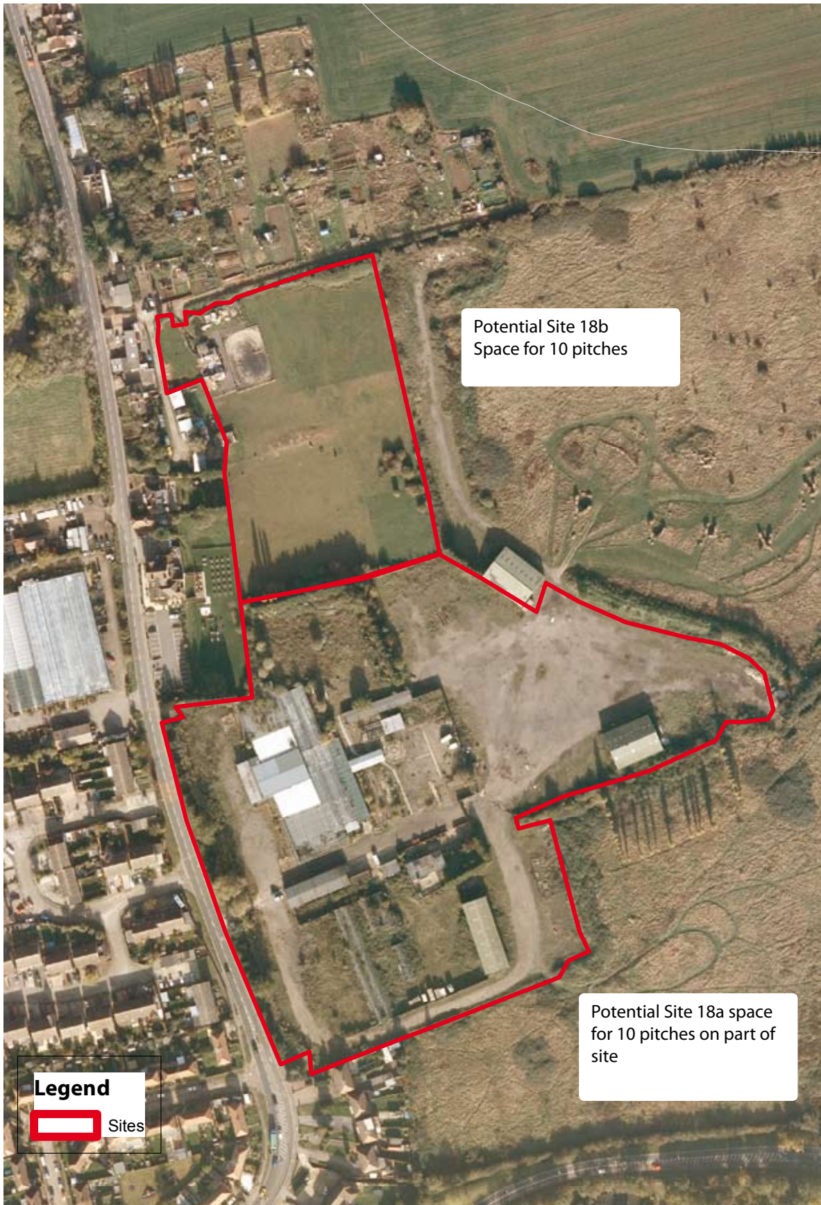
Figure 26 Possible Sites North of Waltham Abbey - Crooked Mile